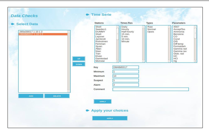
Figure 6.6.4. Data Checks