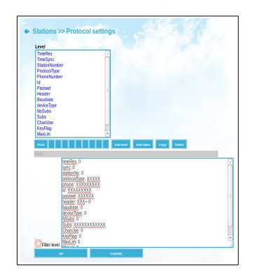
Figure 6.4.5. Protocol Settings

Note : you can request to the System Administrator to configure the "Import" protocol used to extract existent data from a station.