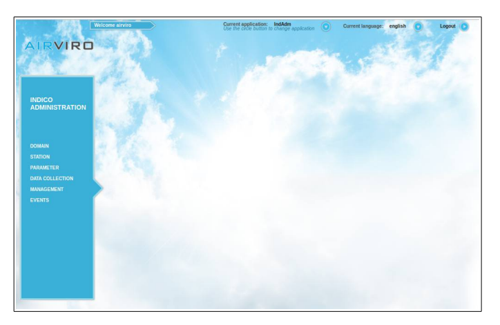
Figure 6.2.2. Main window.