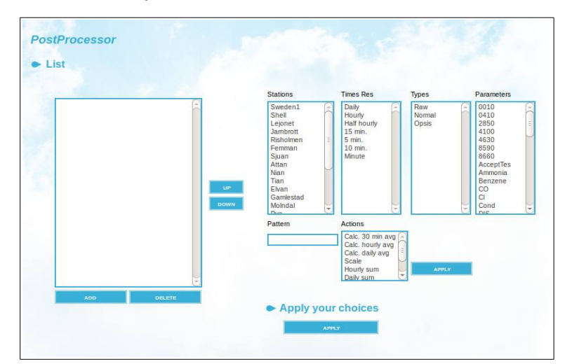
Figure 6.6.3. Postprocessor

The rules are applied to incoming data in sequential order starting from the topmost rule in the list down until the rule that applies to that data is found and then executed ending the process. This process is then repeated with the next data received, and so on.