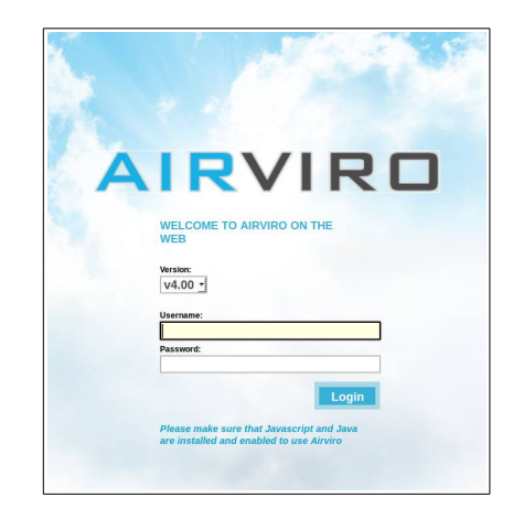
Figure 6.2.1. Input User and password.

By clicking on the Logout [down arrow] button, the current module is closed and the Airviro login page is displayed instead.