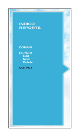
Figure 4.2 Menu.