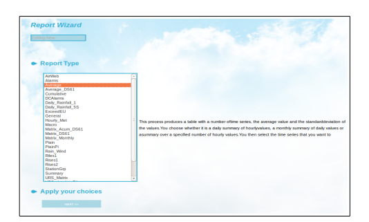
Figure 4.3 Report Wizard.

the [ << Back ] button . Once you have gone through all the wizard steps, at the final step you have to press the [SAVE REPORT] button in order to save the newly configured report. A message saying that "Report saved" will be shown.